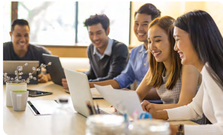
This brochure is for general information only. Refer to the policy contract for full details.

10% of the life insurance coverage or up to ₱100,000 will be given in cash in advance within the next 48 hours.