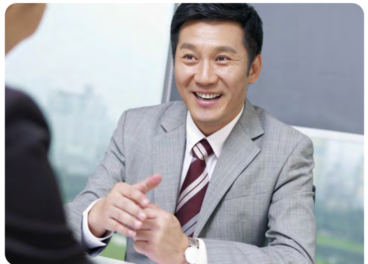
This brochure is for general information only. Refer to the policy contract for full details.

10% of the life insurance coverage or up to ₱100,000 will be given in cash within the next 48 hours for funeral expenses.